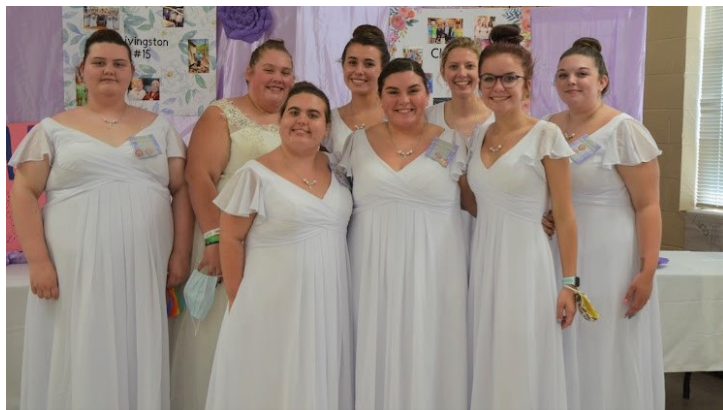
Middle Tennessee Grand Officers 2020-21