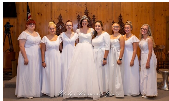
East Tennessee Grand Officers 2020-21