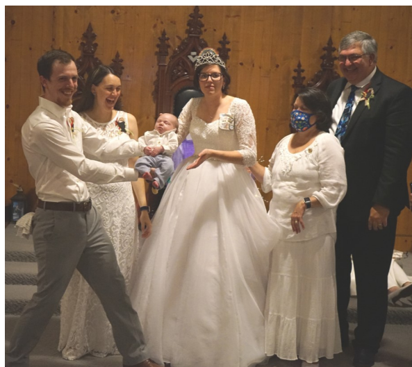
The Broadway Family