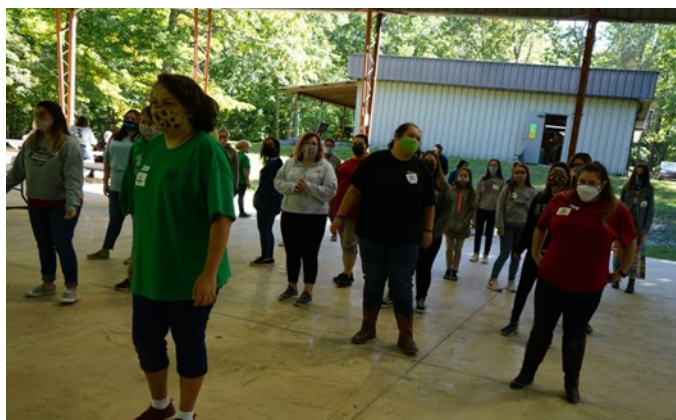
Line dancing....social distancing-style!