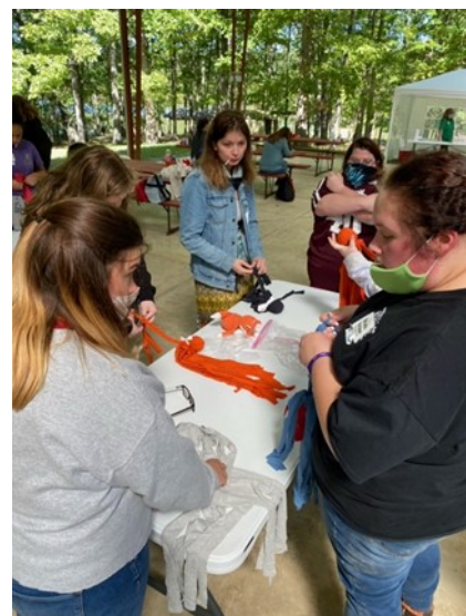
Camp activity....making dog toys from tennis balls and T-shirts